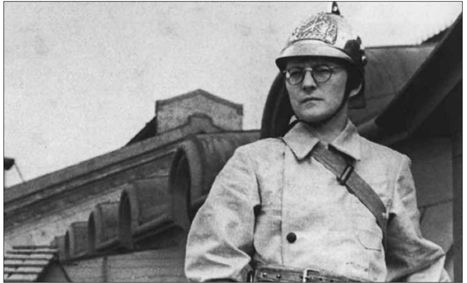
The composer Dmitry Shostakovich as air-raid guard on the roof of Leningrad Conservatory 1941.

When the German troops close the siege ring around Leningrad in September 1941, the future expectations of