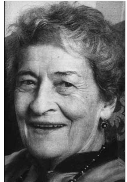
Mary Ainsworth

In Toronto, Mary Ainsworth had worked clinically and on the projective Rorschach test. She was influenced by the "security theory" of her teacher William Blatz . It says: Early in development, family security forms an essential basis. A child needs this in order to develop new skills and interests, otherwise it is all too easily unsettled and thereby impaired. In her later observations and empirical studies, Mary Ainsworth has clarified this and demonstrated that mental security arises essentially from the quality of parental response to children's signals of needs and interests. These means of expression are part of the disposition of natural history of every healthy human new born to communicate in infancy long before speaking. The more reliable the behaviour of their educators is to their needs, the better small children develop a sense of security. To do this, the educators must perceive the child's intentions, recognize them, interpret them correctly, and answer them promptly and correctly. In this way, they become persons of attachment. Mary Ainsworth called this "sensitivity to the infants' signals". The predominant theoretical environment at that time was the social learning theory, which was based on the affirmation of childlike behaviour through rewards – "social reinforcement". However, this