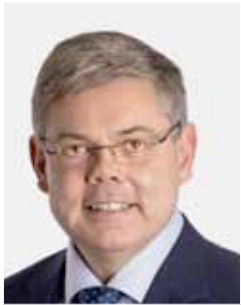
Franz Grüter (picture ma)

A conversation with National Councillor Franz Grüter, IT entrepreneur and president of the initiative committee