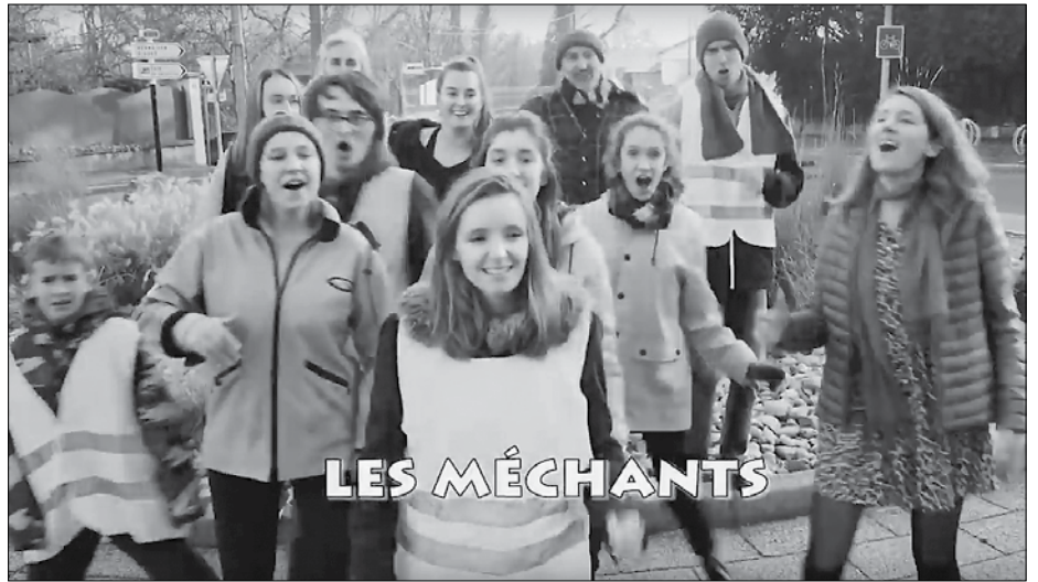
The video on Youtube ( https://www.youtube.com/watch?v=cBiHJxGx1g) became a big hit: The little song sung on it contrasts ironically, in a friendly light tone, "the good guys" ("les gentils") – the elite – with the "bad guys" ("les méchants"), the ordinary people.