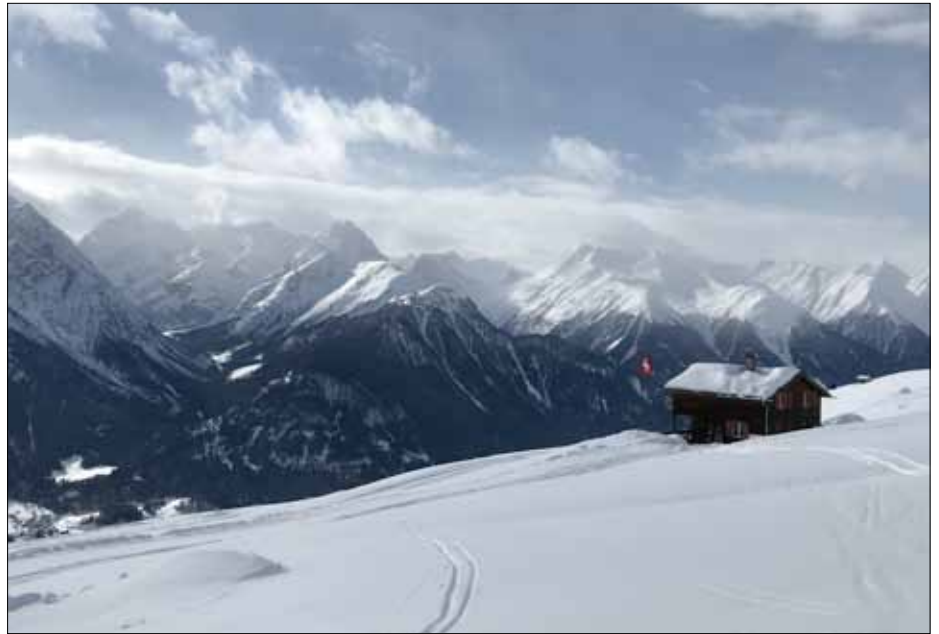
The Swiss model is strong enough to withstand the ravages of time, international pressures and global challenges.