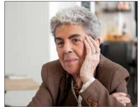
Chantal Delsol (picture ma)

For France is not just a monarchist country, in which the president is giving himself ever greater power, to the detriment of the government and the chambers of parliament. The president has recently snatched from the local authorities the last autonomy they had: the possibility to raise taxes, in this case the housing tax [“taxe d’habitation”]. France is also a country in