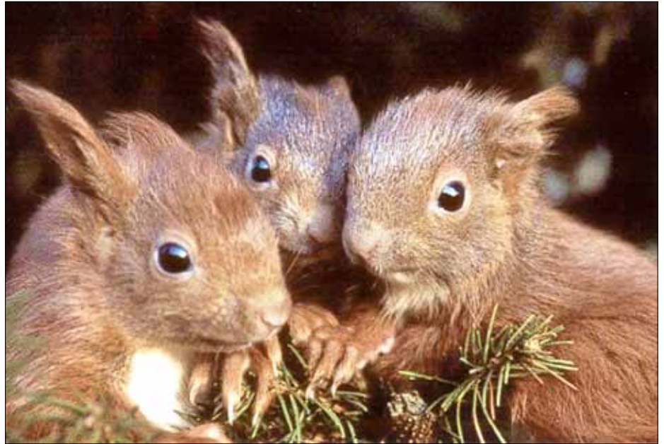
Thanks to its cute nature, the squirrel has become one of the most popular native wild animals; it is a pity that it has not yet been better researched.

We all know the squirrel in a typical calendar sheet pose: sitting upright, a hazelnut or a pine cone in the front paws and the bushy tail – like a parasol, S-shaped over the back. The ancient Greeks called