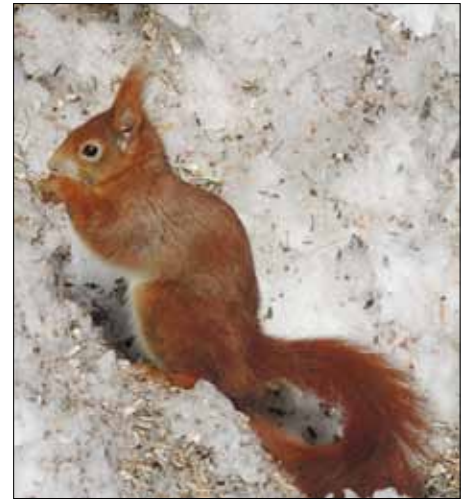
There are red and brown to black colored squirrels, but all with white belly. Reddish varieties are mainly found in lowlands, the dark ones in higher altitudes. (pictures Aita Gross)