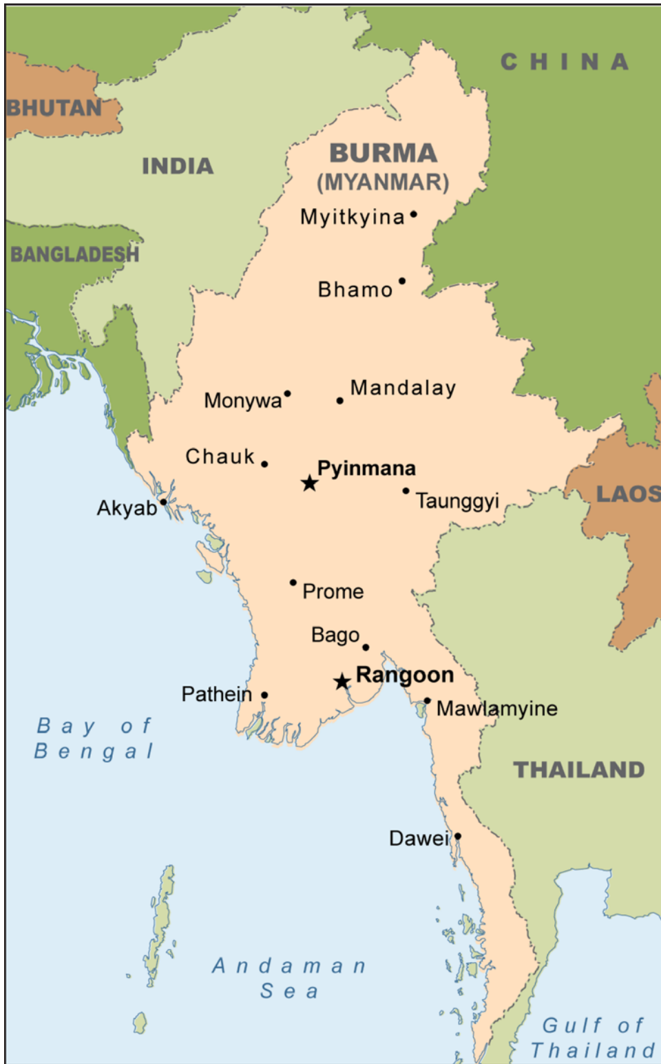
Figure 2. Map of Burma