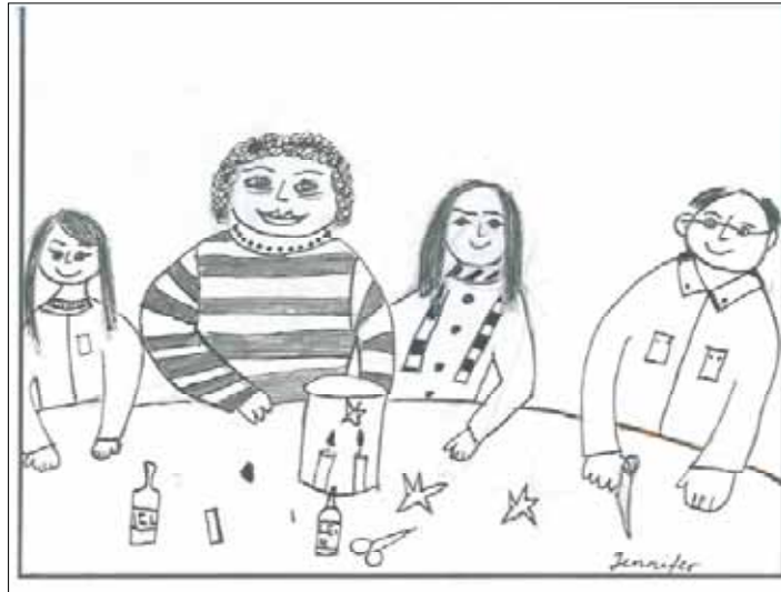
Picture, painted by a child who contributed to the project.

A few years ago I got in touch with the nearby old age and nursing home with the idea of a joint project with the elderly people and my primary school class (4 th to 6 th grade). In my special class I had eight pupils, all of which, for behavioral and learning difficulties, could not be promoted enough or who were no longer acceptable in the regular school. Therefore, after school psychological check-up they had been referred to us by the local school authorities. Various newspaper reports about attacks from younger on older people had deeply worried me. How was it possible that a helpless woman was knocked down for the purpose of robbing her handbag with a few francs in it, or why was it that a man’s kindness and confidence was exploited and betrayed in order to wangle several thousand francs from his savings out of him? But also young persons being brutally beaten up by other youths of the same age was a thing that got really under my skin. As a teacher, how could I