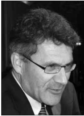
National Councillor Pirmin Schwander

Interview with National Councillor Pirmin Schwander, SVP (Swiss People's Party)