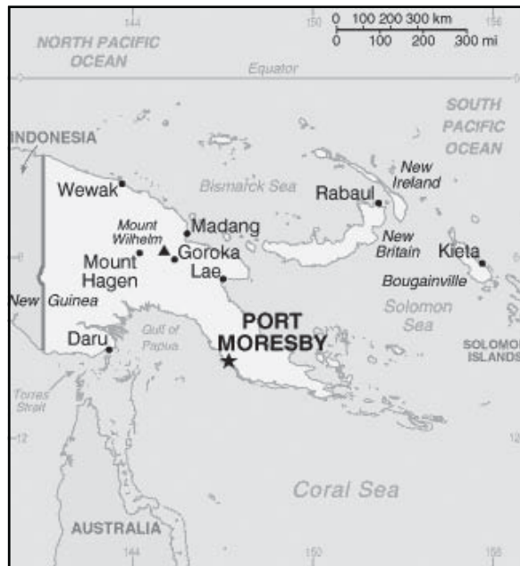
Figure 3 Papua New Guinea

SOURCE: Central Intelligence Agency. RAND OP259-3