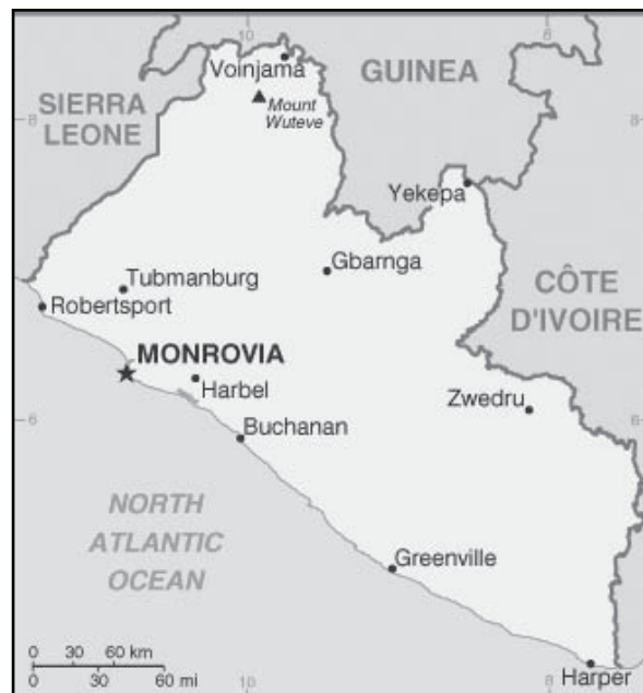
Figure 2 Liberia

SOURCE: Central Intelligence Agency. RAND OP259-2