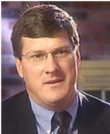
Maj. Scott Ritter