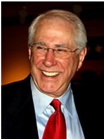
Senator Mike Gravel