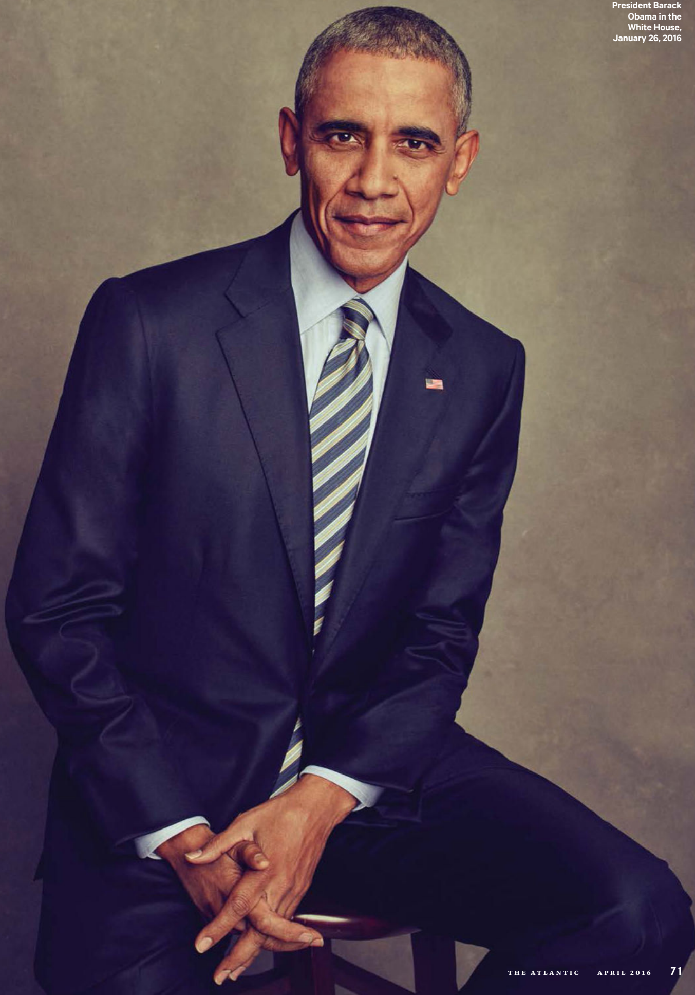
President Barack Obama in the White House, January 26, 2016