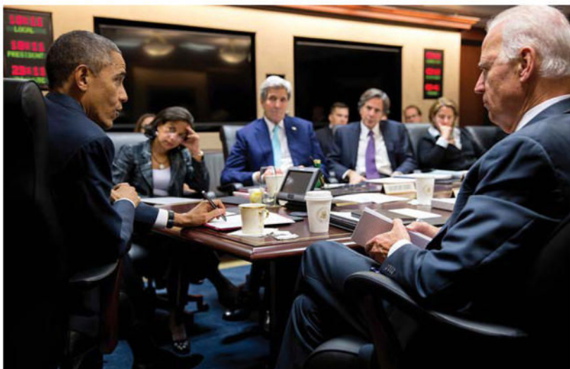
Obama and Vice President Joe Biden meet with members of the National Security Council, including Susan Rice and John Kerry (second and third from left), in December 2014.

Obama was also unsettled by a surprise visit early in the week from James Clapper, his director of national intelligence, who interrupted the President’s Daily Brief, the threat report Obama receives each morning from Clapper’s analysts, to make clear that the intelligence on Syria’s use of sarin gas, while robust, was not a “slam dunk.” He chose the term