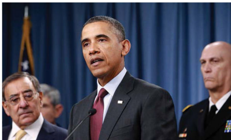
Leon Panetta (left) attends a press briefing on military strategy in January 2012. Panetta, then Obama's secretary of defense, has criticized the president's failure to enforce the Syrian red line.

If a crisis, or a humanitarian catastrophe, does not meet