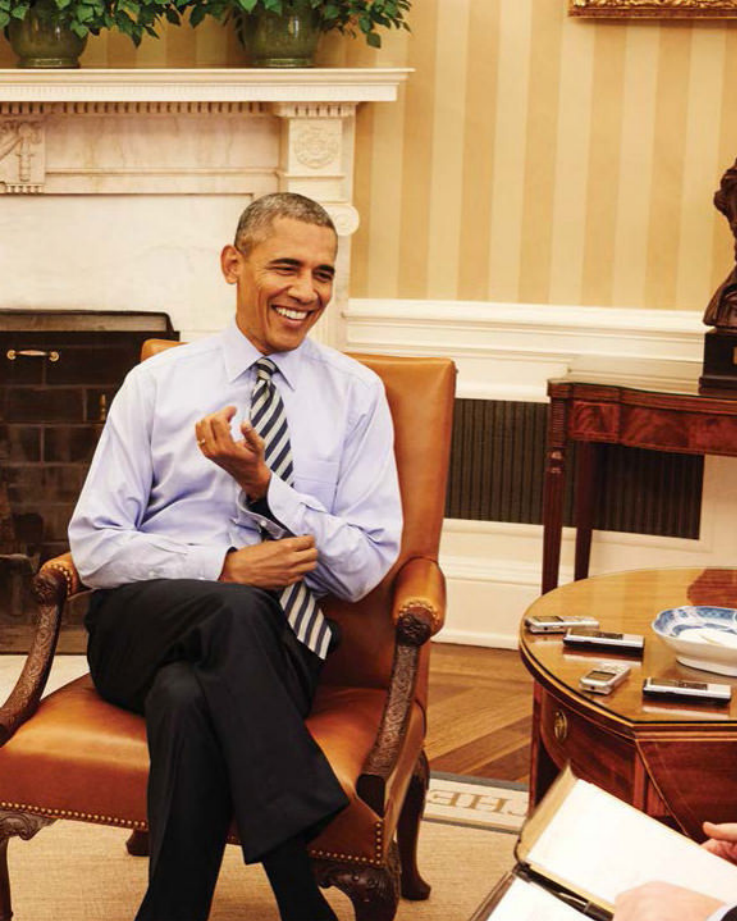
Obama in the Oval Office, where, two and a half years ago, he shocked national-security aides by calling off air strikes on Syria

to protect,” which holds that sovereignty should not be considered inviolate when a country is slaughtering its own citizens. She lobbied him to endorse this doctrine in the speech he delivered when he accepted the Nobel Peace Prize in 2009, but he declined. Obama generally does not believe a president should place American soldiers at great risk in order to prevent humanitarian disasters, unless those disasters pose a direct security threat to the United States.