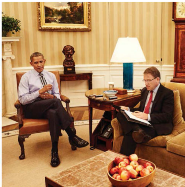
President Barack Obama and Jeffrey Goldberg continue their long-running discussion of foreign policy in the Oval Office, January 26, 2016.