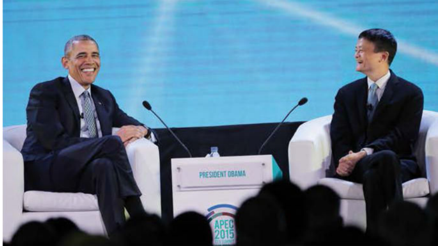
Obama with Jack Ma, the chairman of Alibaba, at the APEC summit in the Philippines last November—days after ISIS killed 130 people in Paris

"Right now, I don't think that anybody can be feeling good about the situation in the Middle East," he said. "You have countries that are failing to provide prosperity and opportunity for their people. You've got a violent, extremist ideology, or ideologies, that are turbocharged through social media. You've got countries that have very few civic traditions, so that