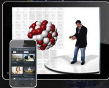
Neil deGrasse Tyson

If You Liked Cosmos , You'll Love this Mind-Bending Series