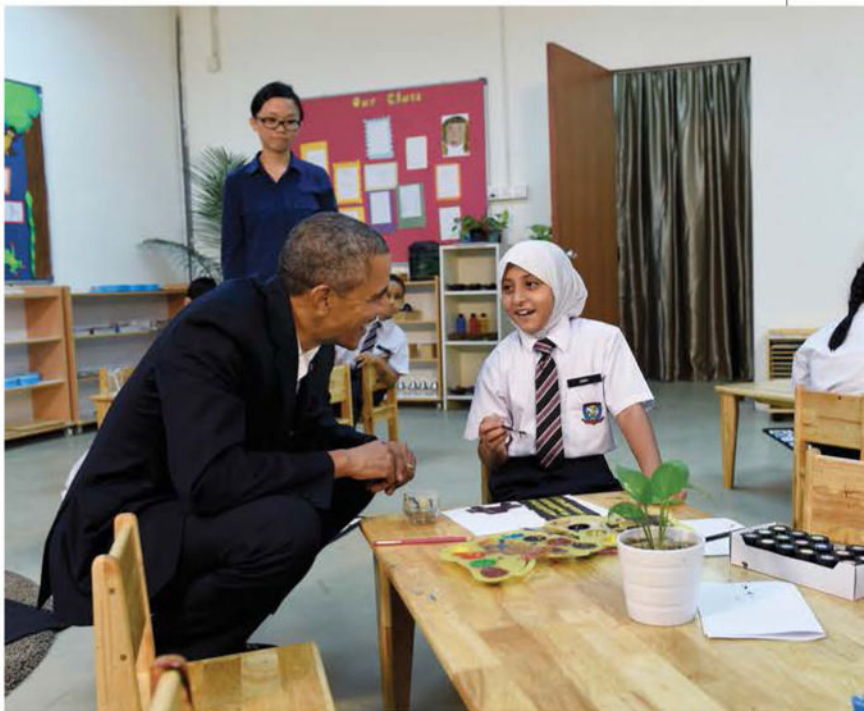
Obama visits a refugee center in Kuala Lumpur on a tour through Southeast Asia last fall. He sees the region as more integral to America's future than the Middle East.

But he went on to say that the Saudis need to “share” the Middle East with their Iranian foes. “The competition between the Saudis and the Iranians—which has helped to feed proxy wars and chaos in Syria and Iraq and Yemen—requires us to say to our friends as well as to the Iranians that they need to