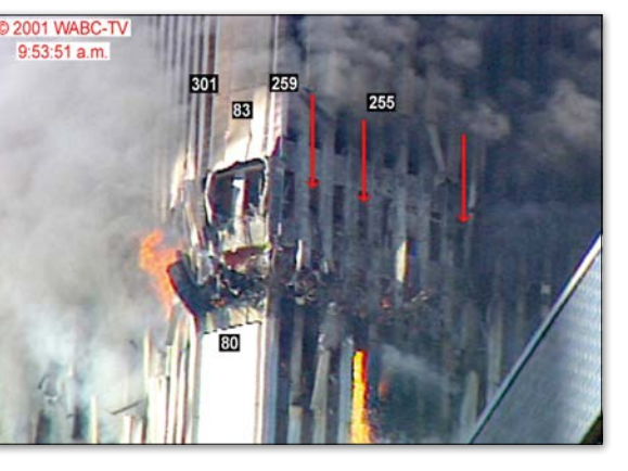
FIG. 6: Molten metal was seen pouring out of WTC 2 continuously for the seven minutes leading up to its collapse.

As for eyewitness accounts, some 156 witnesses, including 135 first responders, have been documented as saying that they saw, heard, and/or felt explosions prior to and/or during the collapses [14]. That the Twin Towers were brought down with explosives appears to have been the initial prevailing view among most first responders. "I thought it was exploding, actually," said John Coyle, a fire marshal. "Everyone I think at that point still thought these things were blown up" [15].