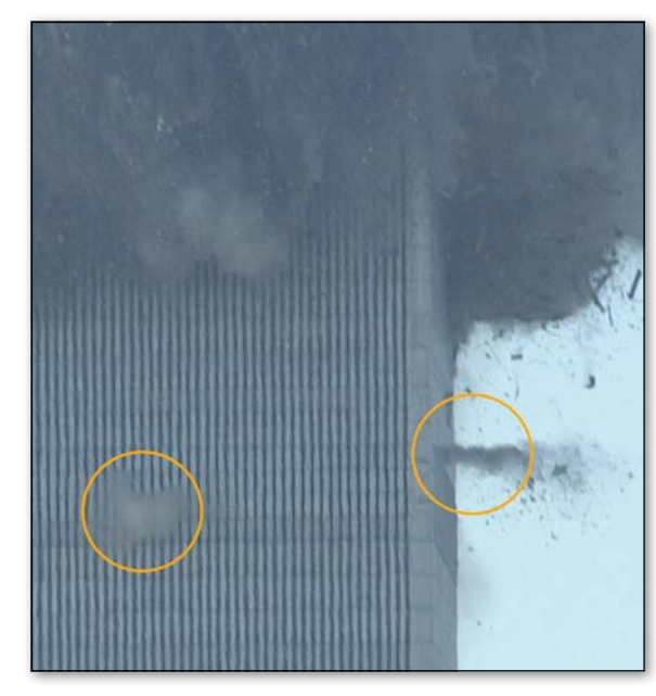
FIG. 5: High-velocity bursts of debris, or "squibs," were ejected from point-like sources in WTC 1 and WTC 2, as many as 20 to 30 stories below the collapse front (Source: Noah K. Murray).

NIST sidesteps the well-documented presence of molten metal throughout the debris field and asserts that the orange molten metal seen pouring out of WTC 2 for the seven minutes before its collapse was aluminum from the aircraft combined with organic materials (see Fig. 6) [6]. Yet experiments have shown that molten aluminum, even when mixed with organic materials, has a silvery appearance—thus suggesting that the orange molten metal was instead emanating from a thermite reaction being used to weaken the structure [12]. Meanwhile, unreacted nano-thermitic material has since been discovered in multiple independent WTC dust samples [13].