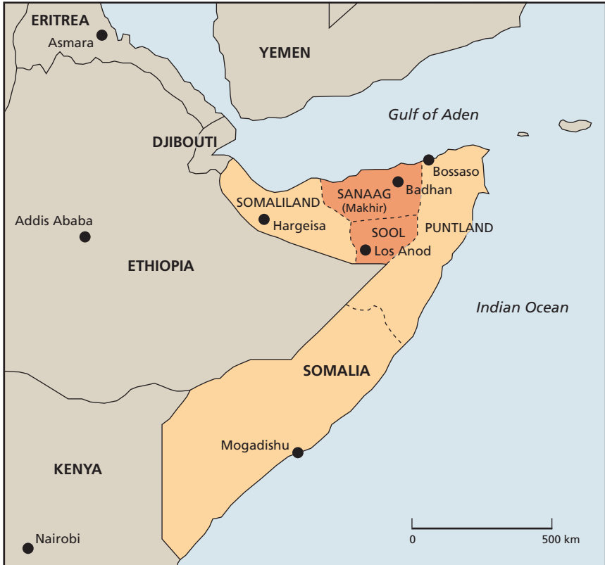
Figure 2.1 Map of Southern Somalia, Puntland, and Somaliland, Showing Disputed Areas Between Somaliland and Puntland