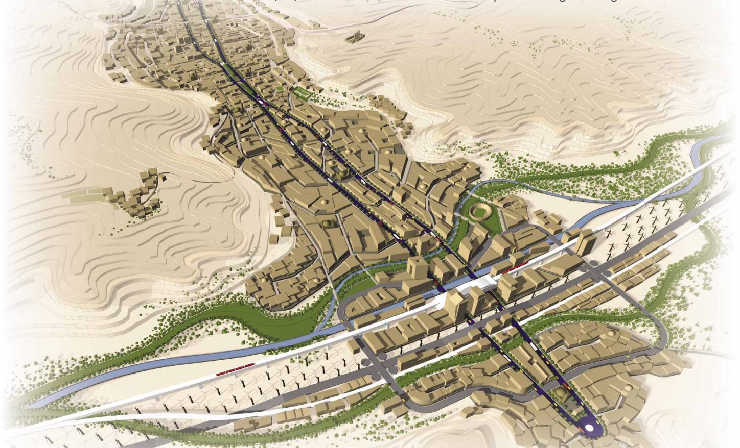
AERIAL VIEW OF PROTOTYPICAL MUNICIPAL AREA

The Arc envisions the West Bank and Gaza as an integrated region of connected cities. One key feature of the Arc is an interurban rail line linking the main cities within the West Bank, and the West Bank and Gaza - including a stop at the international airport - in a journey of just over 90 minutes. Each major city would have a rail station on this main line, located several miles from the historic urban center. The second key feature of the Arc is a series of transit boulevards linking these new stations to the historic urban centers, via an advanced form of bus rapid transit, creating a focus for new economic and residential development along the length of each boulevard.