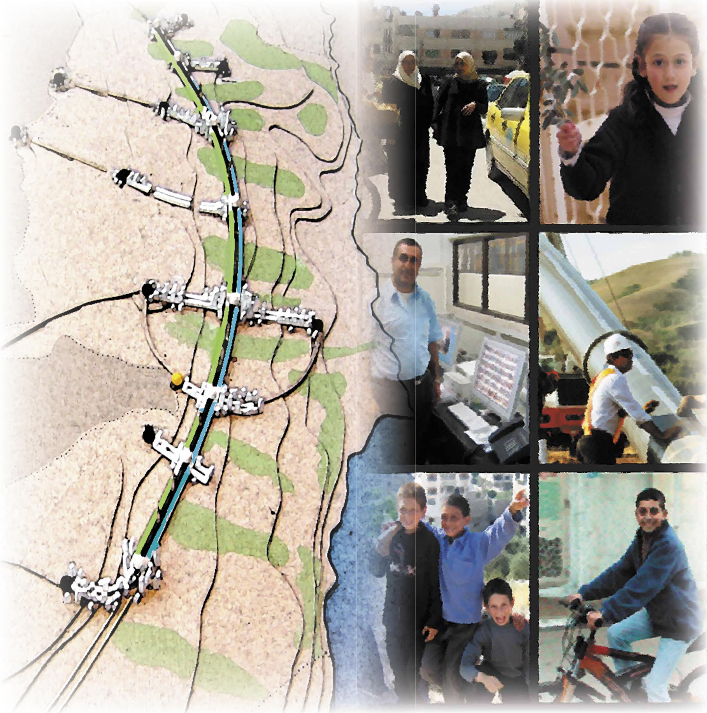
Aerial view of the Arc, RAND's proposal for a sweeping infrastructure corridor linking urban centers, within and between the West Bank and Gaza