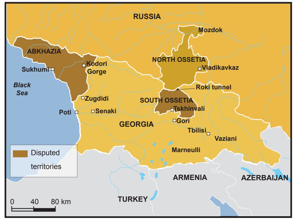
Figure 1: Map of Georgia including the disputed territories