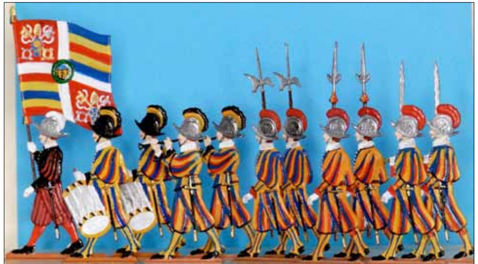
Older motifs such as the Swiss Guard and William Tell still remind us of the origins of the Swiss tin foundry dynasty. (Picture small tin foundry Babette Schweizer)

HH. The artists' village on the western shore of Lake Ammersee, in the district of Landsberg, can be found in the so-called Pfaffenwinkel, where people used to "live under the crosier", as can be seen from the many baroque churches, chapels and monasteries. Besides the art of tin casting, ceramics and Faience also have a long tradition here. ( www.diessener-kunst.de ).