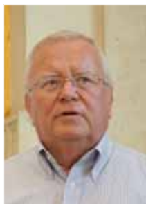
Jacques Myard

by Jacques Myard, political scientist, French politician, Mayor of Maisons-Laffitte, France