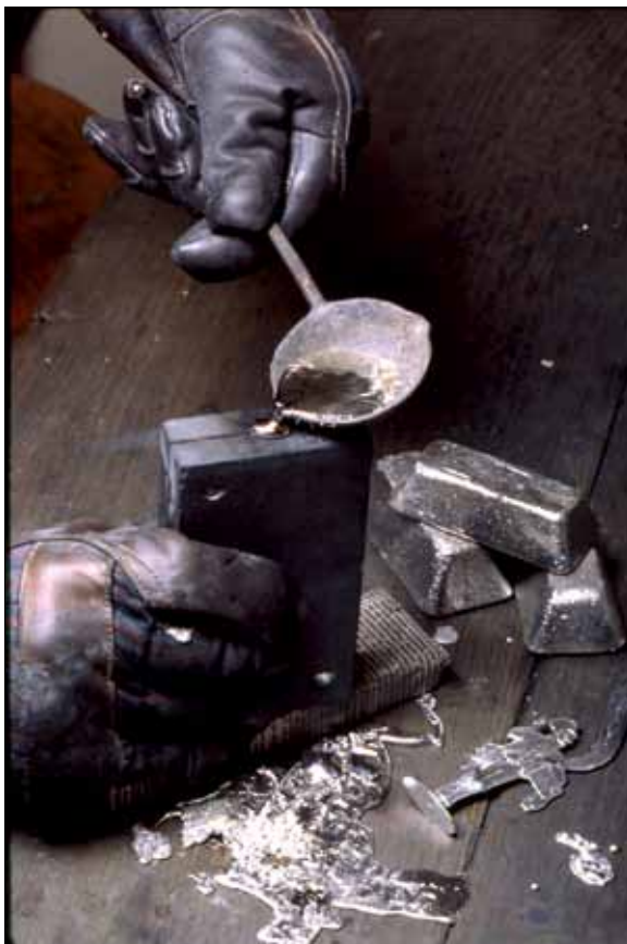
The 400 degree hot tin is filled into the double-sided mould with the casting spoon, while the air escapes through fine channels in the model. (Picture pewter figures Wilhelm Schweizer)

Painting these jewels requires patient precision work: the tin figures are painted individually with ultra-fine brushes, enamel lacquer or oil and acrylic paints, usual-