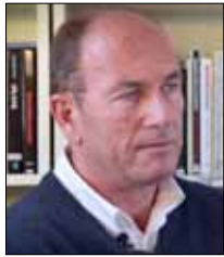
Etienne Chouard (picture ma)

Interview of the monthly magazine “Ruptures” with Etienne Chouard, France