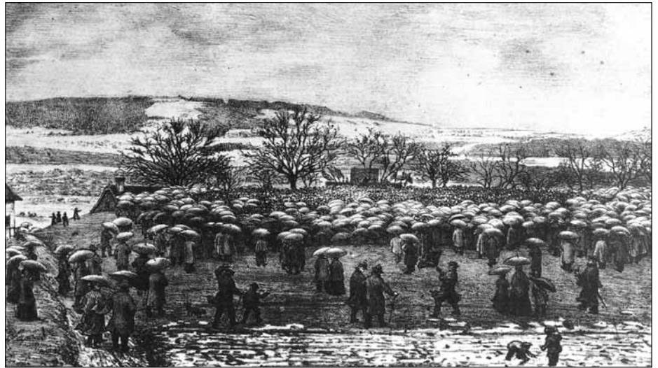
People's Assembly in Uster 1867 directed against Escher's "system" (picture exhibition Alfred Escher, catalogue ISBN 3-908225-08-6)

Now things were moving fast. As early as March 1868, the 222-member Constitutional Council was elected – above all people from the democratic movement. They immediately started to draft a new constitution. A consultation was held throughout the canton, so that everyone could express his or her wishes and concerns. "Referendum and initiative," wrote the Landbote in May 1868, "form the two pivotal points of the political-democratic movement and the decisive demands of the people." 5