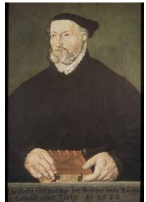
Christoph Froschauer the Elder, painting by an unknown painter, 1556.