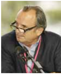
Ivan Rioufol

After the attack on philosopher Alain Finkielkraut during the Yellow Vest demonstration in Paris on 17 February, “Boulevard Voltaire” wanted to know the opinion of Ivan Rioufol, who had been following the movement from the beginning. How does he see its development?