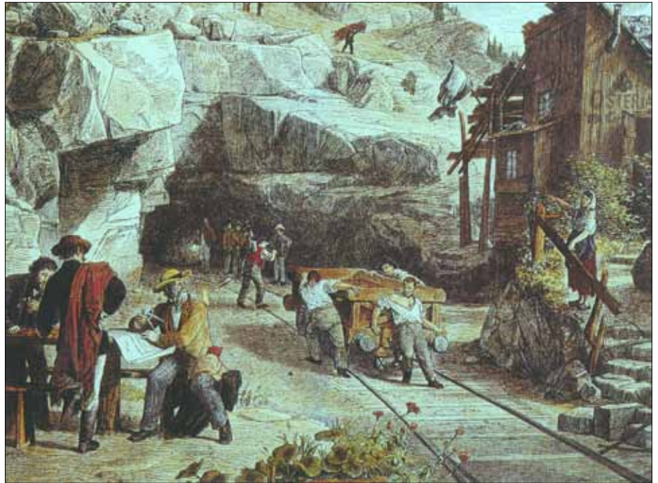
Scene at the south portal of the Gotthard tunnel during the construction works. (Picture exhibition Alfred Escher, catalogue ISBN 3-908225-08-6)

Alfred Escher belonged to the liberal party that determined politics in the years before and after the founding of the federal state in 1848. 2 He was disturbed by the fact that railway construction had hardly begun in Switzerland at that time. Great Britain already had a rail network of