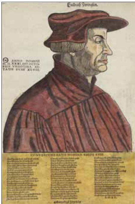
Huldrych Zwingli, single-sheet print by Augustin Fries, Zurich around 1545. Central Library Zurich, PAS II 25/30

With the Reformation and in the spirit of the early enlightenment, the need for schools and education for the population took centre stage. According to the Reformers, Protestants were to regard the Bible as God's word, worship it and read the texts, especially in the families. The Bible was to become the only guideline for religious doctrines. "Sola scriptura", this was one of the demands that contradicted the Roman Catholic papal church and its doctrine. Regarding the revolutionary spread of the Reformation, the illustrated pamphlets were