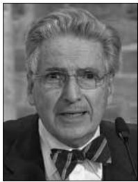
Alfred de Zayas

Open letter by Prof Dr iur et Dr phil Alfred de Zayas*, 23 February 2019