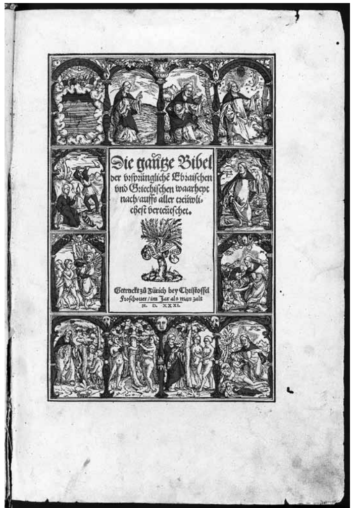
Froschauer Bible, 1531. Central Library Zurich, Zwingli 304.