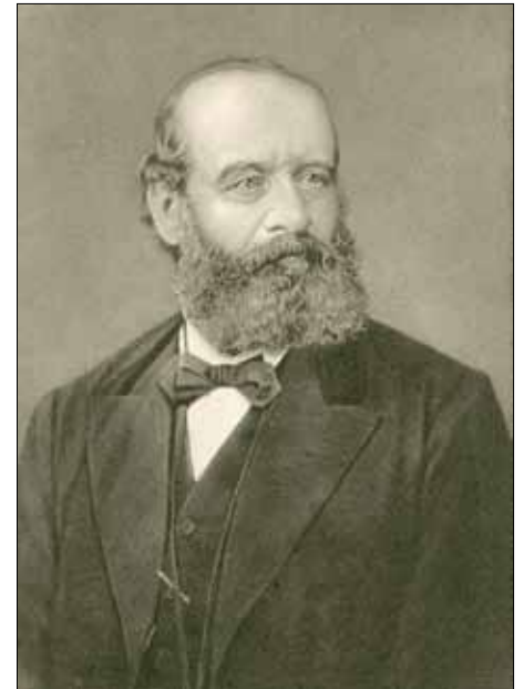
Portrait of Alfred Escher around 1875.

At that time, the cantonal parliament and government were almost exclusively composed of representatives of the Liberal Party, which had dominated the representative democracy in the canton since 1831. The democracy movement, as the opponents called themselves, came