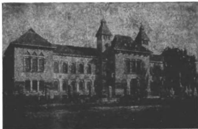
Zemstvo Building in Poltava. Project of V. Krychevsky

After the Revolution of 1917, when the government of the Ukrainian National Republic opened in Kiev a State Academy of Art (November 22,