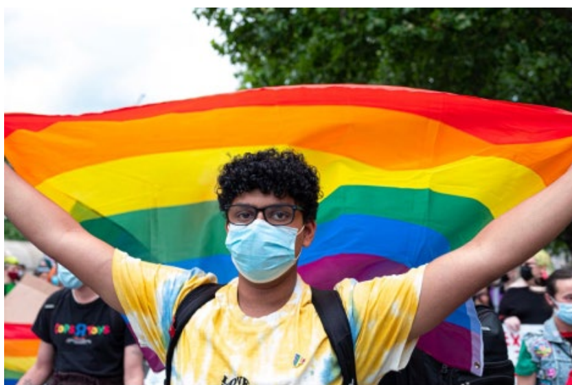
Activist at a Trans Rights Protest in London, Soho

Since the issuance of the Presidential Memorandum on Advancing the Human Rights of LGBTQI+ Persons around the World, ILAB has created mechanisms to coordinate implementation of Administration mandates, including on LGBTQI+ rights; increased staff capacity on LGBTQI+ rights in the labor and employment sphere through trainings and engagement with international organizations and civil society; strengthened coordination with civil society organizations and international organizations to identify gaps in efforts