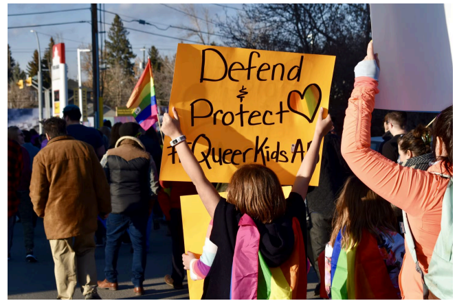
Activists at a Gay-Straight Alliance march in Calgary, Canada (March 29, 2019)

ITA is supporting the LGBTQI+ community within its Foreign Service Officer corps through participation in the State Department's interagency Same Sex Spouse Accreditation Working Group. This group is working to collect and share with the LGBTQI+ Officer corps the best available information about host country laws and attitudes toward the LGBTQI+ community, with the goal of informing those Officers' decisions about choosing country assignments.