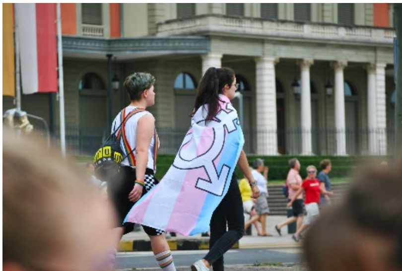
Activists at an LGBTQI+ Pride Parade in Geneva

The International Criminal Investigative Training Assistance Program (ICITAP) delivered webinars worldwide to promote racial justice, inclusion, and police reform. In September, ICITAP-trained Ukrainian police officers ensured the peaceful assembly of thousands of participants at the annual Equality March in Kyiv, Ukraine. During FY21, in the Dominican Republic, ICITAP delivered training and mentoring to the Dominican National Police Directorate for Attention to Women and Domestic Violence to strengthen police relations with the LGBTQI+ community.