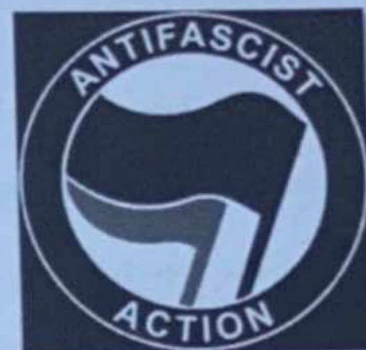
(U) ANTIFA United States