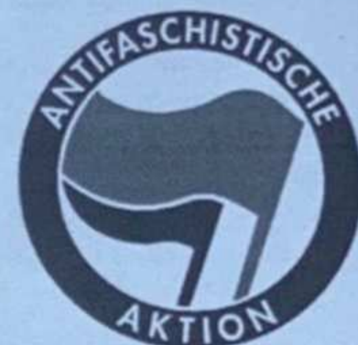
(U) ANTIFA Europe