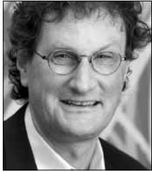
National councillor Geri Müller.

Interview with National councillor Geri Müller