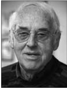
Helmut Hubacher

Courtemaiche (JU, Jura). The security policy was one of the core topics of the former long-standing SP (Socialist Party) Member of the National Council and party president Helmut Hubacher. He is convinced, that Switzerland needs an Air Force, as long as it has an Army. New to the Gripen procurement for him is that the Army does no longer impose measures against the Defense Department.