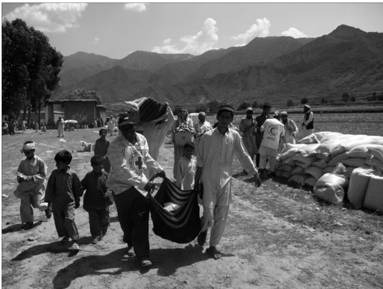
Staff members of the ICRC help refugees in the province Kunar in Afghanistan. "Yet we still come back to one simple truth: the overriding factor behind lack of compliance is lack of political will by both States and non-State armed groups. Without the requisite political will, even the most refined compliance mechanisms will be little more than empty vessels."

Ladies and gentlemen, Armed conflicts have evolved enormously over the past 60 years and lines have become increasingly blurred between various parties to an armed conflict, as well as between combatants and civilians. It is civilian men, women and children who have increasingly become the main victims. IHL has necessarily adapted to this changing reality. The adoption of the first two Additional Protocols to the Geneva Conventions