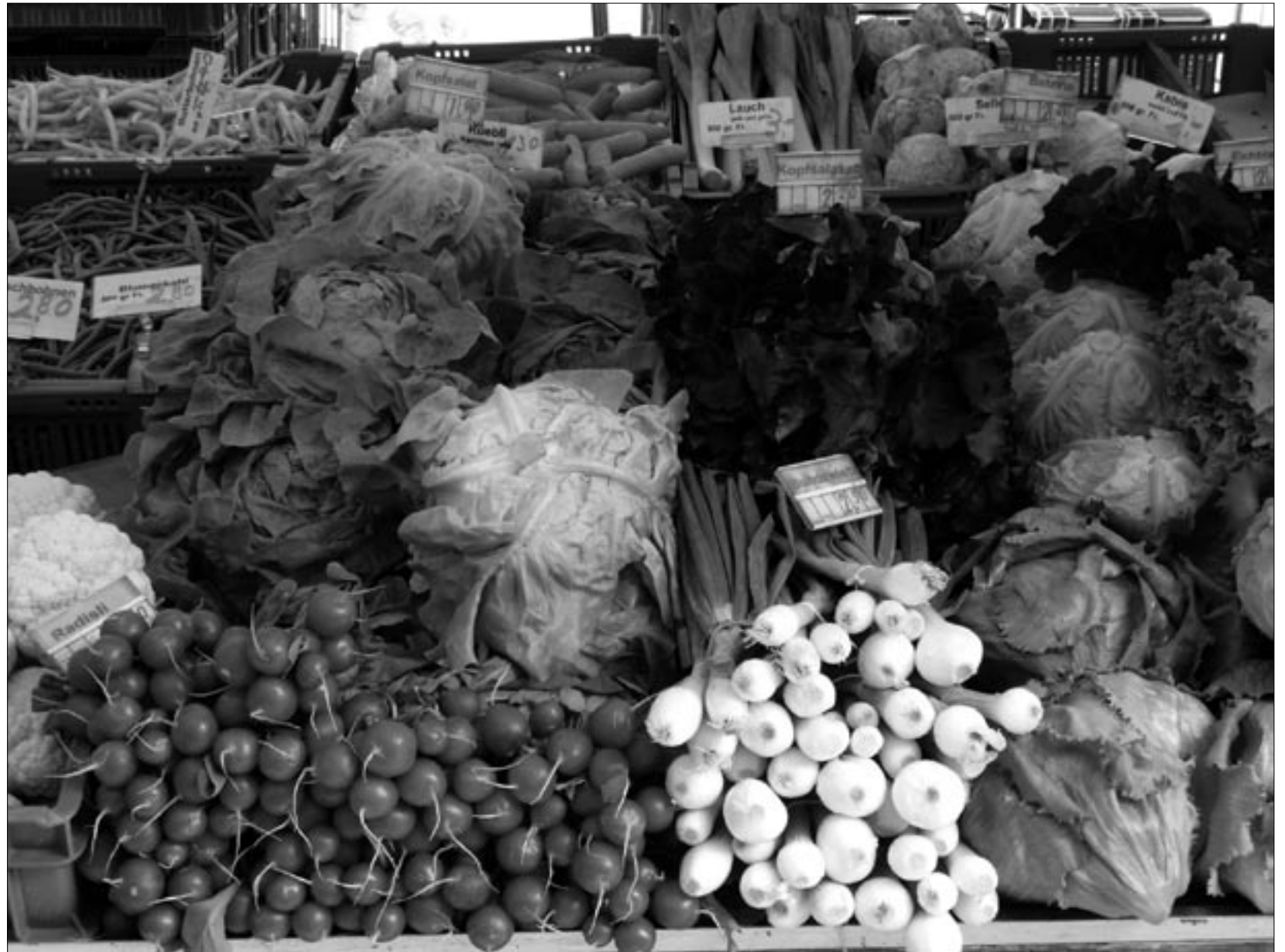
Small-scale and environment-friendly agriculture and market gardening is definitely being valued by a growing number of consumers. (picture thk)

The example of Katarina E. At medium age, Katarina E. switched from secretarial work to vegetable cultivation. She went to an agricultural college and decided to cultivate vegetables by means of organic farming. After finishing her training, she found no job in this field, so she decided to establish a small enterprise of her own. She leased some hectares of land outside a town in Southern Sweden and started to grow vegetables. During the first two years she sold her vegetables on markets and