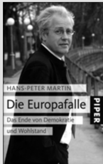
Hans-Peter Martin. Die Europafalle. Das Ende von Demokratie und Wohlstand. ISBN 978-3-492-04671-8