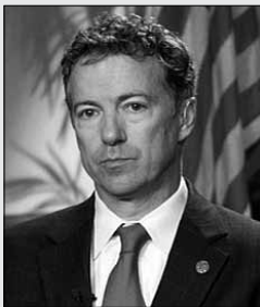
Senator Rand Paul (picture ma)

US senator Rand Paul is in principle against any agreement. Because of his resistance a solution between Switzerland and the United States will be blocked in the Congress.