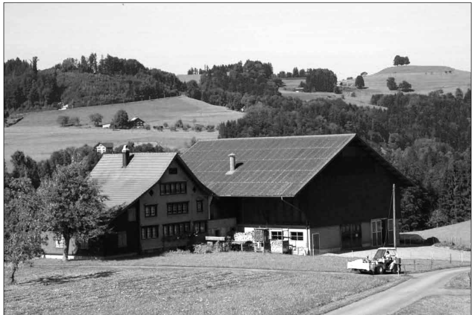
Three popular initiatives have been taken in order to maintain an opportune and sustainable agriculture in Switzerland. (picture mt)

2011 Parliament froze the ongoing negotiations with the EU. The milk price is becoming more and more of a problem in Switzerland, as in Germany. Attempts to support the milk price without introducing a government-set quota are not very effective. There is an oversupply of milk (which squeezes the price), and the butter