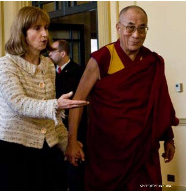
U.S. Undersecretary of State Paula Dobriansky, left, walk with the Dalai Lama to their meeting, Monday, April 21, 2008, in Ann Arbor, Mich.

U.S. leadership should continue to be open to face-to-face meetings with the Dalai Lama but should choose the occasions for those meetings strategically and in a way that advances a larger agenda rather than merely provokes a response of outrage from the Chinese.