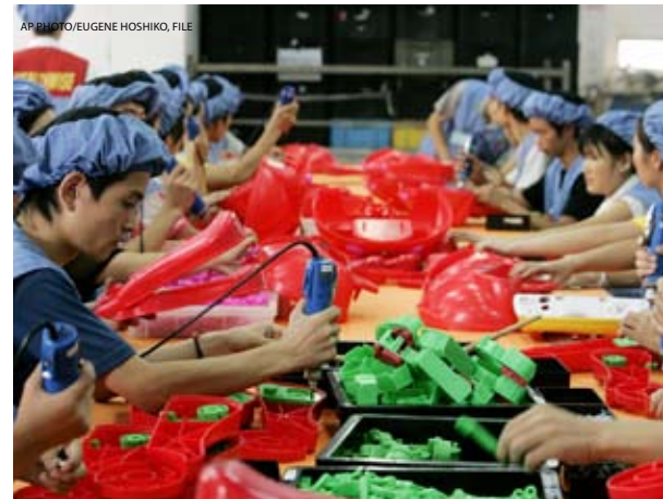
Workers assemble toys at the production line of Dongguan Da Lang Wealthwise Plastic Factory in Dongguan, China in this Sept. 4, 2007 file photo.

Congress and the Obama administration should review these reports to determine the extent to which U.S. corporations are adhering to these standards and, if necessary, to take remedial action. These could include, for example, the creation of audit controls of foreign direct investments in China and restrictions on stakeholders of companies engaged in violations of human rights.