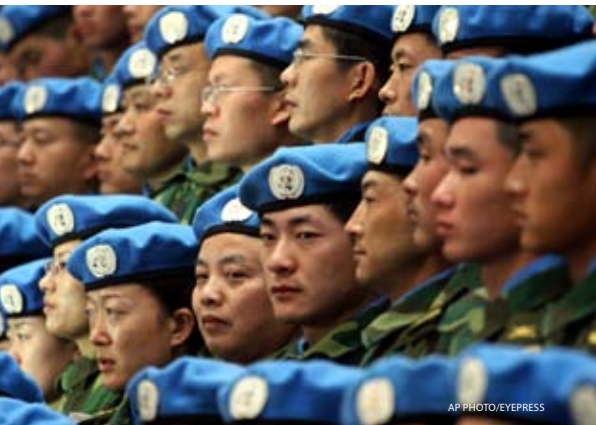
Chinese peacekeepers prepare to depart for their United Nations mission to Sudan from an airport in Zhengzhou in Central China’s Henan province, Tuesday, Jan. 16, 2007.

The United States also should invite meaningful input from non-governmental organizations into the dialogue process, and should not allow the preservation of the dialogue to preclude public criticism of China’s human rights record. In addition, the United States should coordinate its approach with its allies, especially (but not exclusively) the European Union, which has been engaged in its own human rights dialogue with China for more than 10 years. 53 Washington should explore with its allies the resurrection of the so-called Bern Process or something like it in order to help “re-globalize” the approach to human rights in China. 54