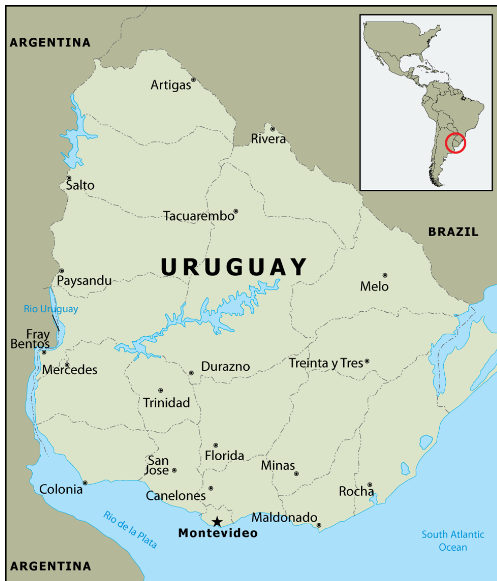
Figure 1. Map of Uruguay