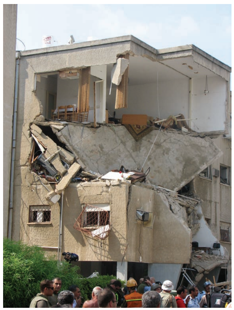
A rocket hit this apartment building in the Bat Galim neighborhood of Haifa on July 17, 2006, wounding six residents.

Haifa Police Chief Meri-Esh believes Hezbollah was aiming mostly at targets in the port area and that the relatively few rockets that reached the upper city were "over-shots." The problem is that between the port area and the more affluent upper city neighborhoods on the hill are the lower residential neighborhoods, some densely populated. Thus, if Hezbollah was in fact trying to hit objects on the waterfront, its inaccurate rockets, flying a distance of thirty kilometers, stood a good chance of striking—and did indeed strike residential and shopping neighborhoods just beyond.