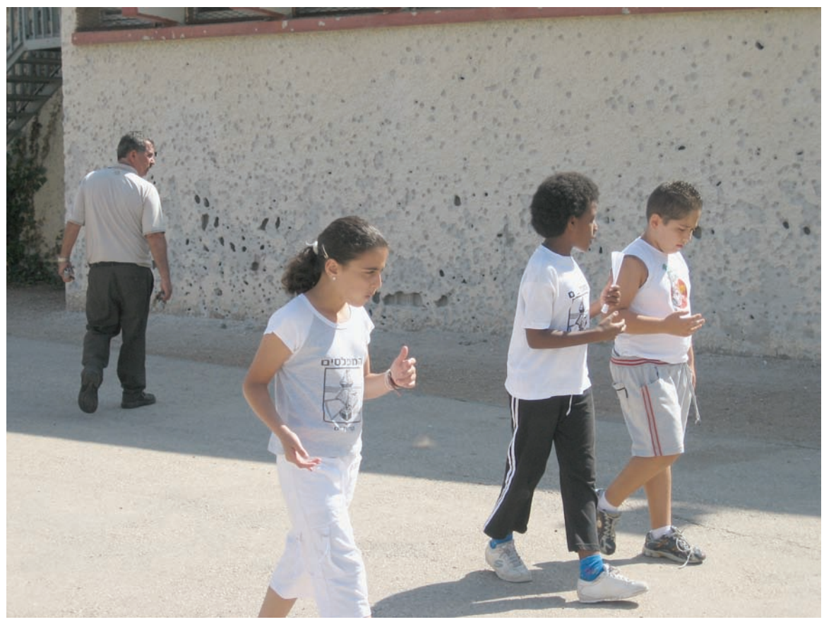
A wall of the elementary school "HaMiflasim" in Kiryat Yam, damaged by steel spheres from a rocket that hit an adjacent classroom on August 13, 2006.

Hezbollah provided no specific information about its attacks on Kiryat Yam or its intended targets there; it has not replied to Human Rights Watch requests for information about these attacks.