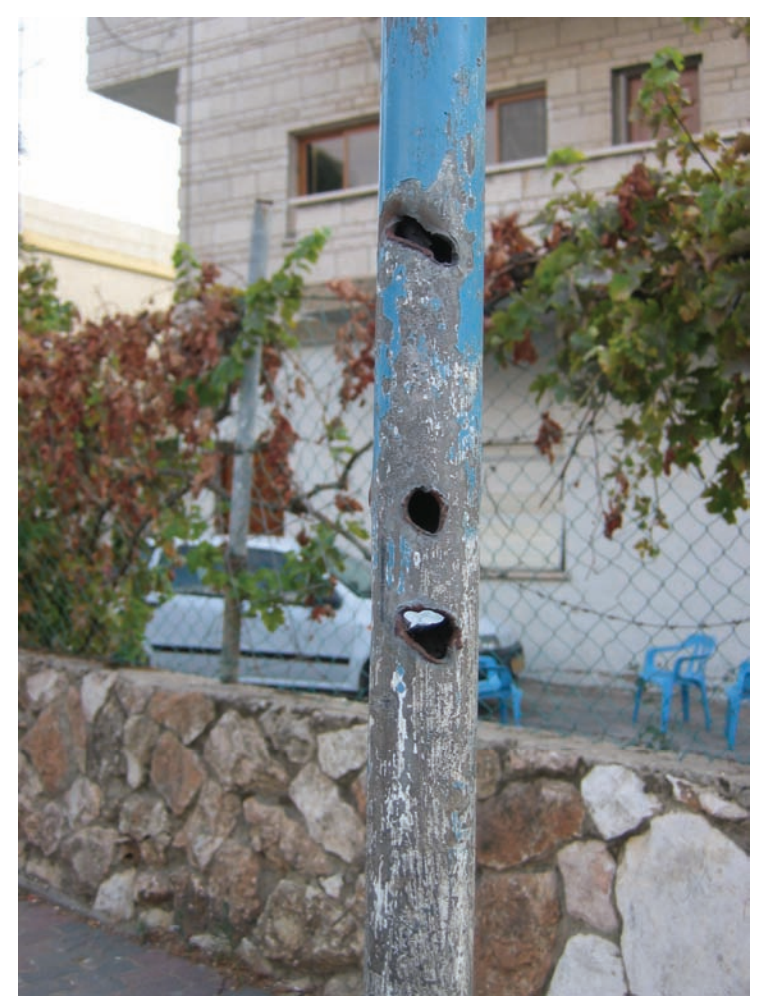
A pole on a sidewalk in Majdal Krum that was penetrated by steel spheres and shrapnel from a rocket that landed on the street nearby on August 4, 2006, killing two men.

Visiting the site of the attack on September 30, Human Rights Watch saw a filledover hole in the street that Hussein said the rocket had caused, as well as shrapnel damage on nearby poles and street signs.