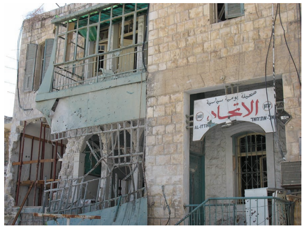
A building in the Wadi Nisnas neighborhood of Haifa, housing the archives of al-Ittihad newspaper, after a rocket struck on August 6, 2006, killing two elderly persons next door.

If Hezbollah had indeed been targeting military or industrial objects in Haifa some of the time, it expressed no regret for the civilian casualties it was inflicting until its rockets first hit the majority-Arab neighborhood of Wadi Nisnas on August 6, killing two residents and seriously wounding a third. It was then that Hezbollah secretarygeneral Nasrallah went on television to urge Arab residents to leave the city. (See chapter below on "Hezbollah's Justifications for Attacks on Civilian Areas.")