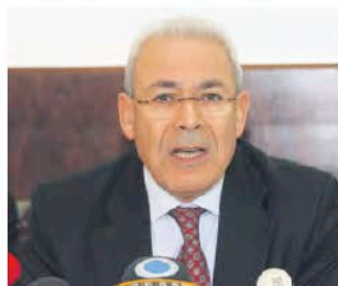
BURHAN GHALIOUN LEADER OPPOSIZIONE SIRIANA 67 ANNI

Il leader dell'opposizione siriana in esilio