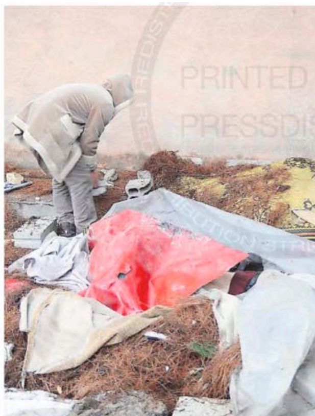
Cuerpos de tres rebeldes, guardados entre escombros en un patio trasero