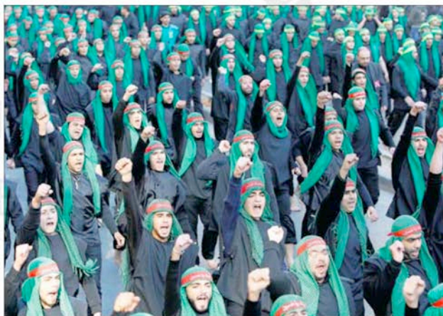
Arab Spring withers: Lebanese Hezbollah supporters march on Ashura, a holy day, in Beirut's suburbs in December. The group's leader is enthusiastic for the pro-democracy movement — except in Syria.

Nasrallah also praised the Arab Spring democracy movements in Bahrain, Yemen and Libya. But he has no apparent enthusiasm for the uprising in