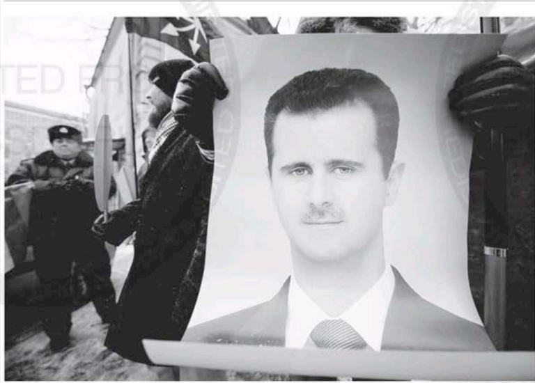
A supporter held a portrait of President Bashar al-Assad outside the Syrian Embassy in Moscow on Wednesday. The Syria-Iran axis is seen as being weaker than it was a year ago.