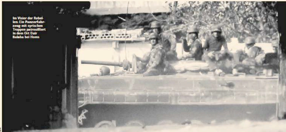
In Vielder der Rebellien. Ein Panzerfahrzeug mit syrischen Truppen patrouilliert in dem Ort Dair Balaba bei Homs

Die Empörung über das Vorgehen des syrischen Präsidenten Baschar al-Assad gegen die Aufständischen wächst. Im Sicherheitsrat halten Russland und China noch ihre schützende Hand über das Regime. Militärisch entgleitet diesem vielerorts die Kontrolle