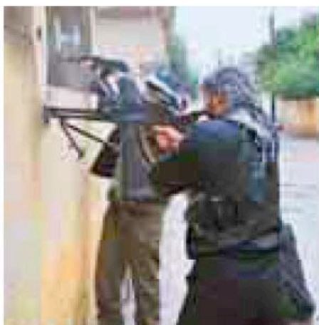
Rebels take their position behind a wall as they fire their guns during a battle with Syrian forces.