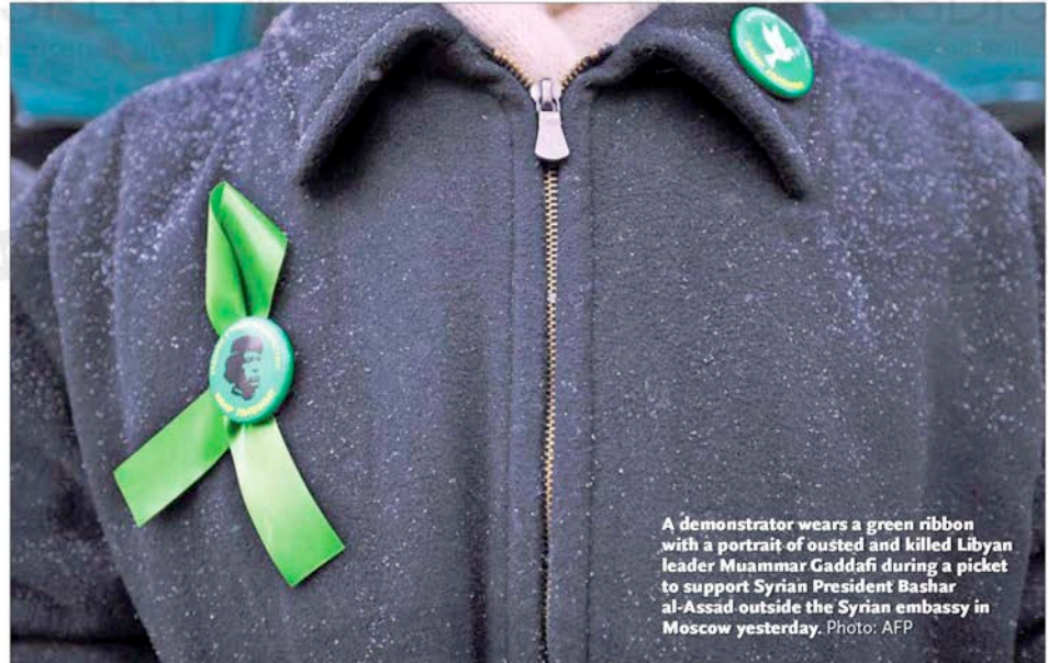
A demonstrator wears a green ribbon with a portrait of ousted and killed Libyan leader Muammar Gaddafi during a picket to support Syrian President Bashar al-Assad outside the Syrian embassy in Moscow yesterday.

day for "rapid and decisive action" and Western states spoke of a potential vote this week. But Russia warned that rushing the resolution through would doom it to failure.