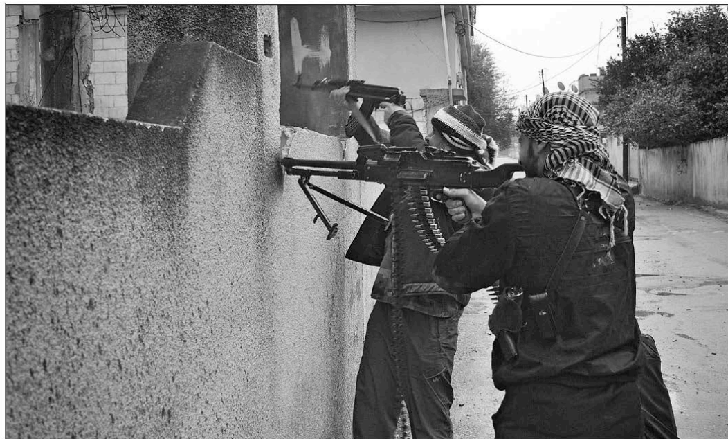
Fierce clashes: Syrian rebels open fire during a battle with government forces in the central Homs province on Tuesday

"It's a symbolic gesture," Ausama Monajed of the Syrian National Council, the main opposition umbrella group, said of the planned rally. "It's to unify the country."