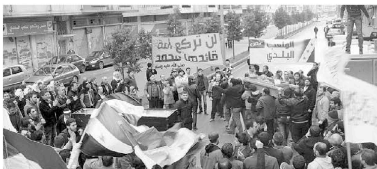
À Homs, une scène quasi quotidienne, des funérailles d'opposants se transforment en manifestation antirégime.

Sur le terrain, les affrontements entre les forces syriennes et l'Armée syrienne libre (ASL) se sont rapprochées de Damas. D'après les militants, la campagne de répression est la plus violente depuis le début de la révolte en mars 2011. Au moins 70 personnes sont mortes hier, selon al-Jazira. Le bilan le plus lourd a été établi dans la province de Damas, avec 24 civils tués, dont un enfant de trois ans, par des tirs des forces de l'ordre. D'après les insurgés, l'armée a lancé une offensive dans la nuit de mardi à mercredi pour contrer la menace des forces rebelles. Dans le nord de Damas, les soldats ont pris le contrôle de Rankous et l'ont étendu aux alentours, bombardant notamment le village de Telfita. Dans la zone de Wadi Barada, qua-