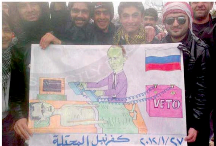
Protesters hold a caricature which shows Russian Prime Minister Vladimir Putin aiding his Syrian ally President Assad during a demonstration at kfarnebel town in Idlib province, Syria.

In another, he consults with two devils about how to deal with the uprising. They suggest he kill a single protester to scare the others.