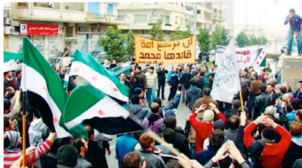
ANTI-GOVERNMENT PROTESTERS wave flags and carry coffins Tuesday during the funeral of two protesters killed in Homs.

Russia and China, both veto-wielding Security Council members, have resisted a Western push for a resolution condemning the Syrian government's