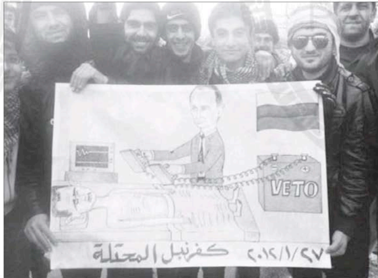
Anti-Syrian regime protesters hold a caricature placard showing Russian Prime Minister Vladimir Putin aiding his Syrian ally President Bashar Assad during a demonstration at Kfarnebel town in Idlib province, Syria.

However, Russia signaled on Wednesday it would veto a draft UN resolution calling on Assad to step down unless it explicitly ruled out military intervention to halt the