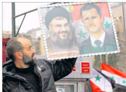
Regime moves to crush protests: A man holds a poster of Syrian President Bashar Assad, right, and Lebanon's Hezbollah chief, Hassan Nasrallah, during a pro-regime rally in Damascus on Jan. 11.