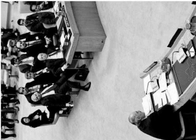
L'am bassadeur d e Syrie à l'ONU, Bachar Al-Jaafari, et les dirigeants de la Ligue arabe, au Conseil de sécurité des Nations unies, à New York, le 31 janvier.