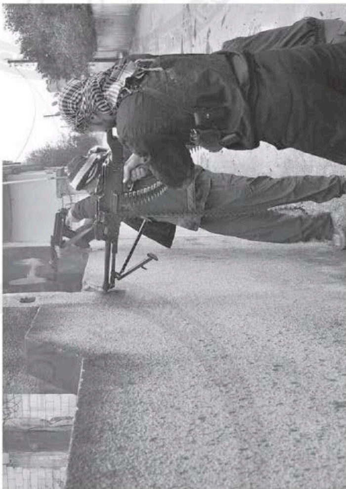
Syrian rebel forces took positions behind a wall while firing at government troops in Homs province on Tuesday.

proposed resolution, "if it is a text that we consider erroneous, that will lead to a worsening of the crisis, we will not allow it to be passed. That is unequivocal," Reuters reported. "If the text will be unacceptable for us, we will vote against it, of course."