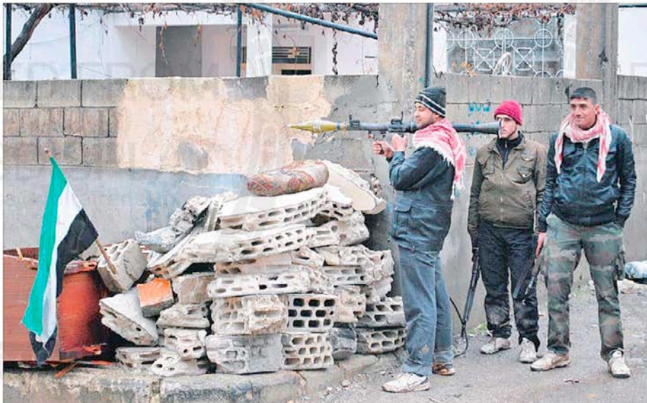
Syrian rebels are trying to overthrow a regime that is among the best customers of the Russian arms industry.

Tests for the jet fighters began in December of last year, CAST said in a report obtained by Reuters before its publication. Damascus was also likely to receive deliveries of Buk anti-aircraft missiles this year, it said.