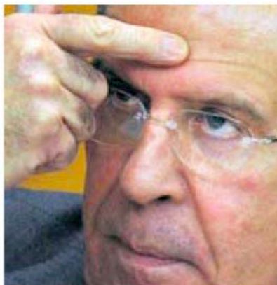
Sergéï Lavrov, ministre russe des Affaires étrangères.

Pourtant, cette fois-ci, les propos de Sergéï Lavrov n'ont pas provoqué l'exaspération des Occidentaux. Les diplomates européens semblent même convaincus que le Kremlin finira par accepter de pousser Bachar El-Assad à transférer son autorité à son vice-président. Avec, pour cadrer la transition démocratique, de possibles négociations entre les deux parties à Moscou,