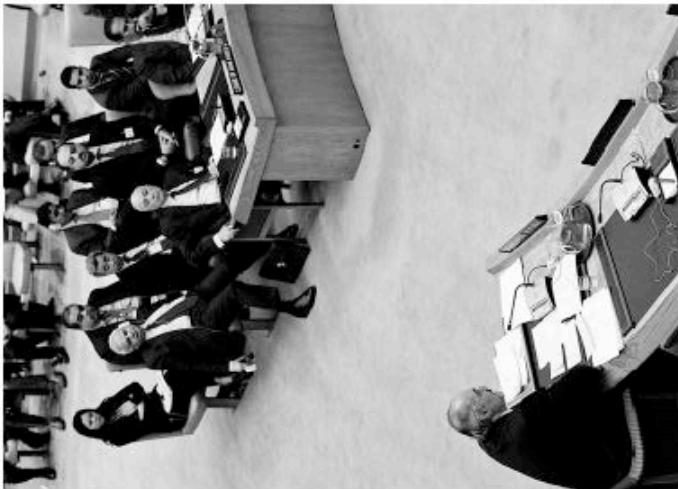
L'am bassadeur d e Syrie à l'ONU, Bachar Al-Jaafari, et les dirigeants de la Ligue arabe, au Conseil de sécurité des Nations unies, à New York, le 31 janvier.