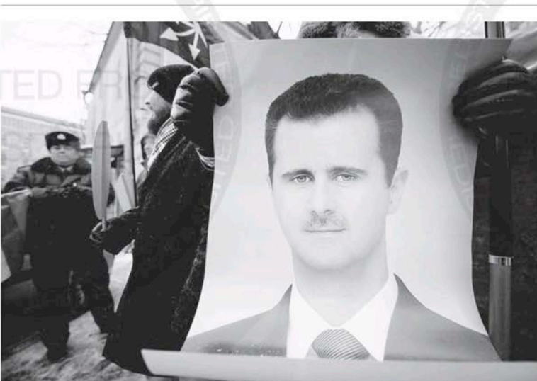
A supporter held a portrait of President Bashar al-Assad outside the Syrian Embassy in Moscow on Wednesday. The Syria-Iran axis is seen as being weaker than it was a year ago.

The funeral service took place in the privacy of her family