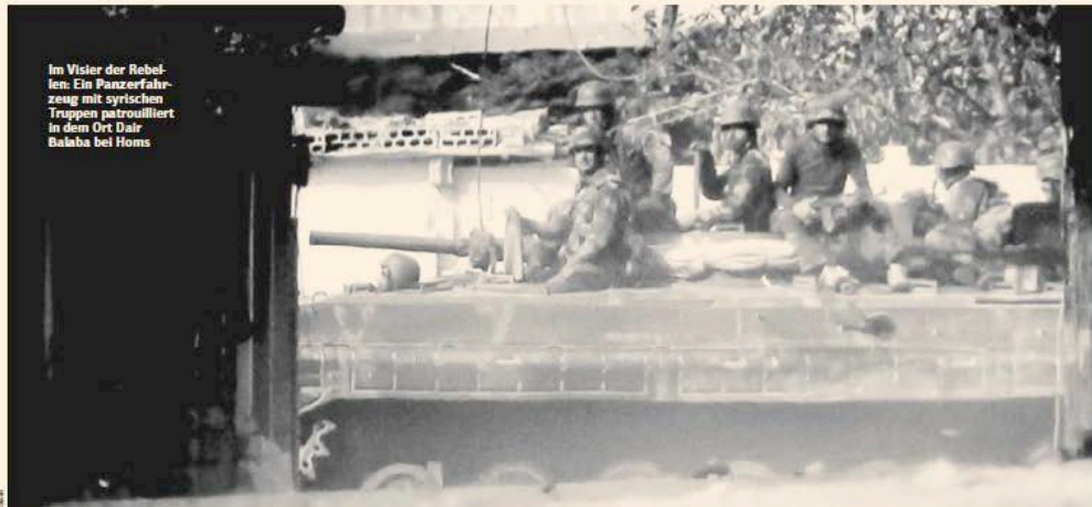
In Vielder der Rebellien. Ein Panzerfahrzeug mit syrischen Truppen patrouilliert in dem Ort Dair Balaha bei Homs

Die Empörung über das Vorgehen des syrischen Präsidenten Baschar al-Assad gegen die Aufständischen wächst. Im Sicherheitsrat halten Russland und China noch ihre schützende Hand über das Regime. Militärisch entgleitet diesem vielerorts die Kontrolle