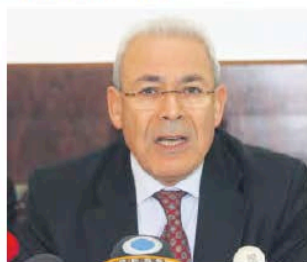
BURHAN GHALIOUN LEADER OPPOSIZIONE SIRIANA 67 ANNI

Il leader dell'opposizione siriana in esilio