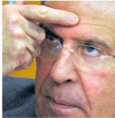
Sergueï Lavrov, ministre russe des Affaires étrangères.

Pourtant, cette fois-ci, les propos de Sergueï Lavrov n'ont pas provoqué l'exaspération des Occidentaux. Les diplomates européens semblent même convaincus que le Kremlin finira par accepter de pousser Bachar El-Assad à transférer son autorité à son vice-président. Avec, pour cadrer la transition démocratique, de possibles négociations entre les deux parties à Moscou,