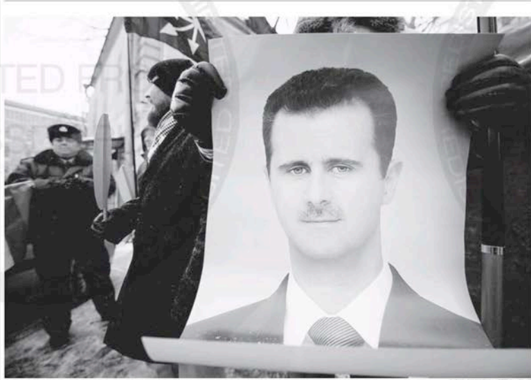
A supporter held a portrait of President Bashar al-Assad outside the Syrian Embassy in Moscow on Wednesday. The Syria-Iran axis is seen as being weaker than it was a year ago.